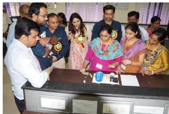
Project Demonstration by BMS Students to JCI expert Team