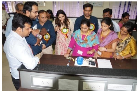
Project Demonstration by BMS Students to JCI expert Team